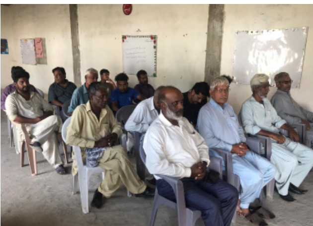
Focus group discussion regarding issues faced by community regarding WASH

Understood the Dynamix in which community is sufferings from many health hazards due to non-availability of basic facilities. timely completion of the assignment successful summation and acceptance of the ready to implement plan by the donor