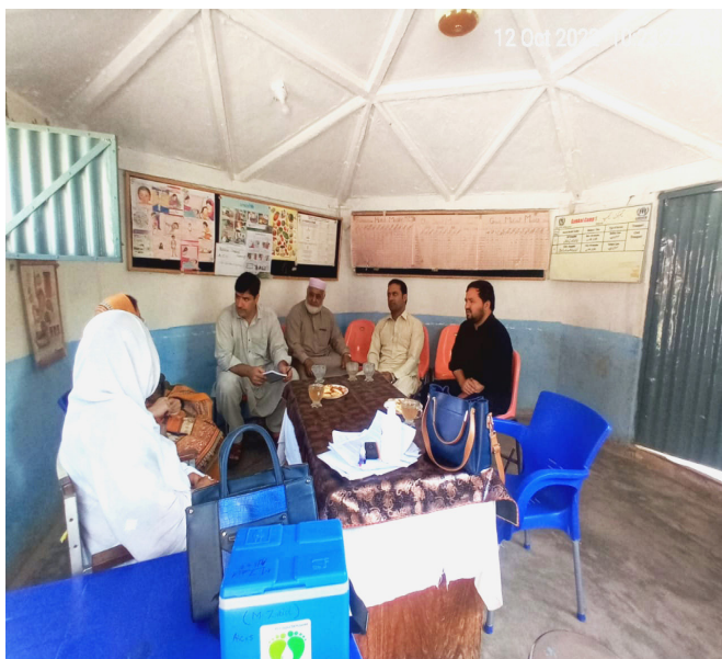
Health Site at AR BHU Gamgol Camp 1 (Kohat)- [TPFM-KP]