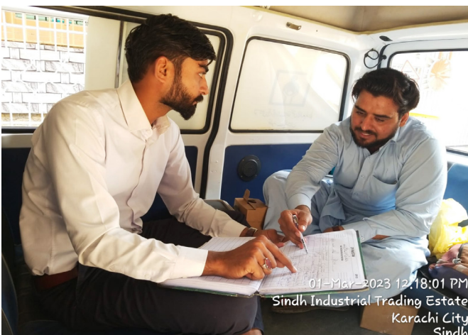
Field Monitors during Monitorig the Mobile van

With the support of Bill & Malanda Gates Foundation (BMGF), Tameer-e-Khalaq Foundation (TKF) is assisting the Government of Sindh by conducting intensive third-party