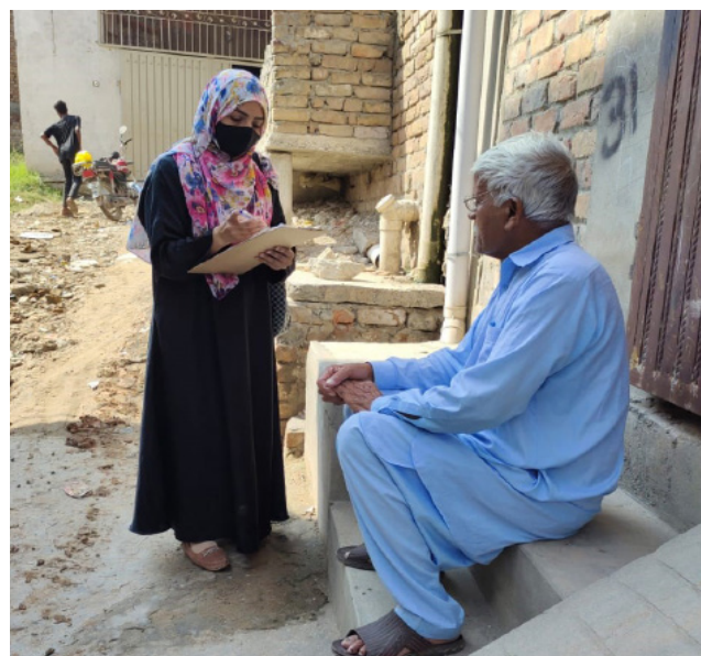
TKF Staff conducting key informant Interview

Verification Data Analysis and reporting Development of final report Implementation Plan Communication material for awareness