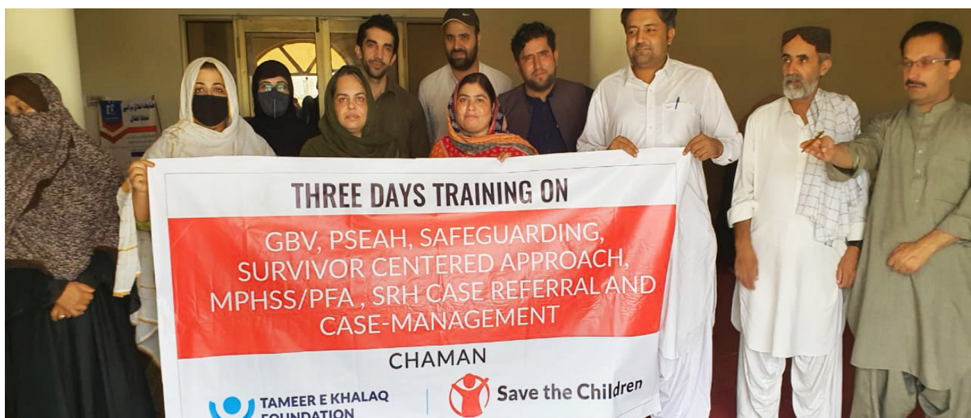
3 Day Training on GBV, PSEAH, Safeguarding survivor centered approach, MPHSS/PFA and Case Management, Chaman