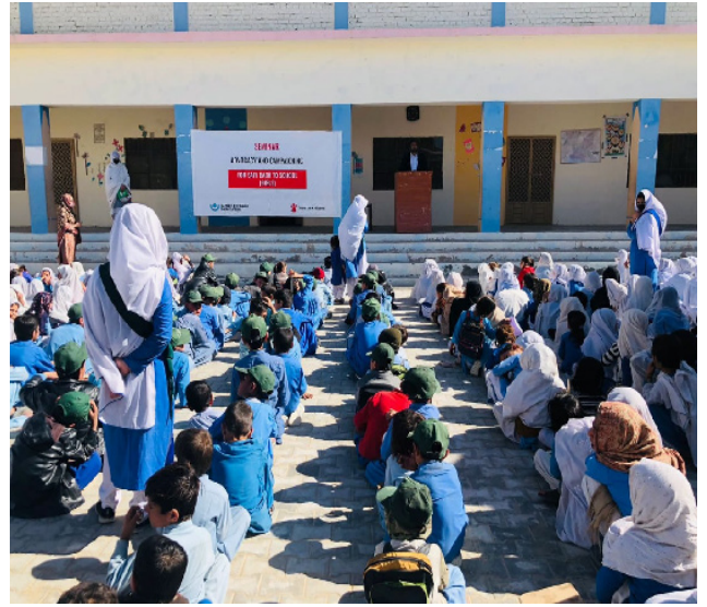
Advocacy and campaigning for safe back to school

The post project prospects of CONNECT are good in district Chaman. For instance, teachers' training and Child resilience sessions have long lasting impacts on children' behavior and in building capacity of children. Similarly, provision of missing facilities has somehow made the WASH facility at schools useable, moreover, some other NGOs are also working with same component, so, the schools will be receiving help from those organization in the post CONNECT time period as well. Moreover, strengthening the EMIS system and provision of equipment's will benefit the education department for long time, that is indeed a very good sign in terms of seeing long lasting impacts of the project. The overall work during the course of the project has allowed masses to know about the work of SCI and its implementing partner TKF. Hence, cooperation to the organizations by local people is highly expected.