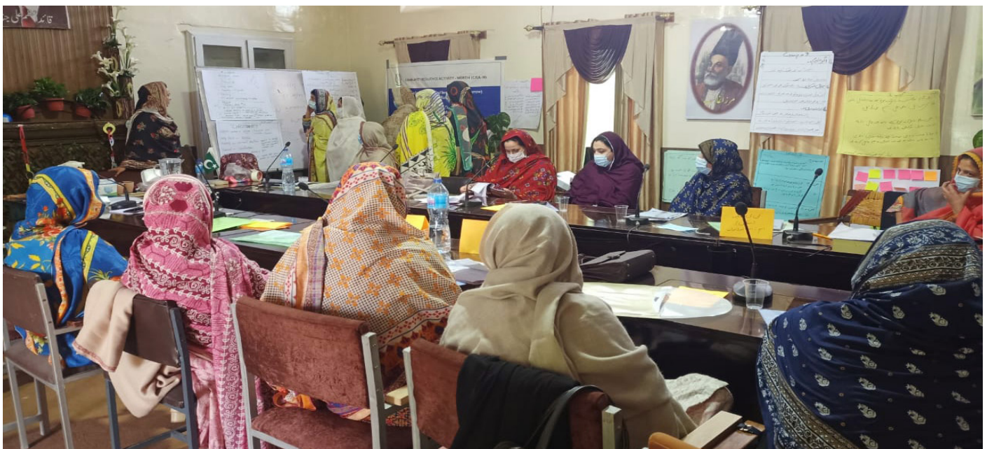
Session on Peace building Upper Kurram

Two Proposals have been submitted for NW and Kurram for CRA-N activities