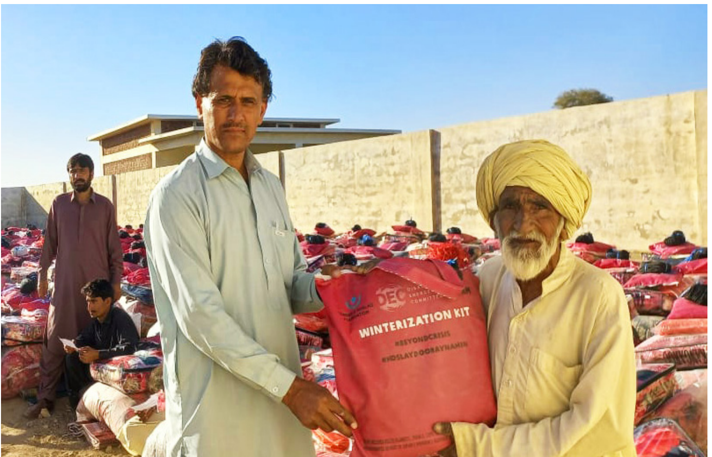
Winterization kit distribution district Jafferabad