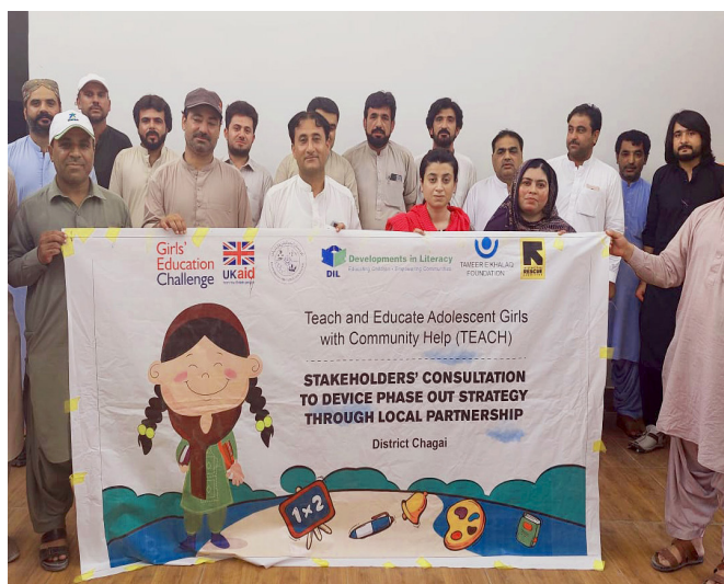
One day orientation session on monitoring of production centers under TEACH project