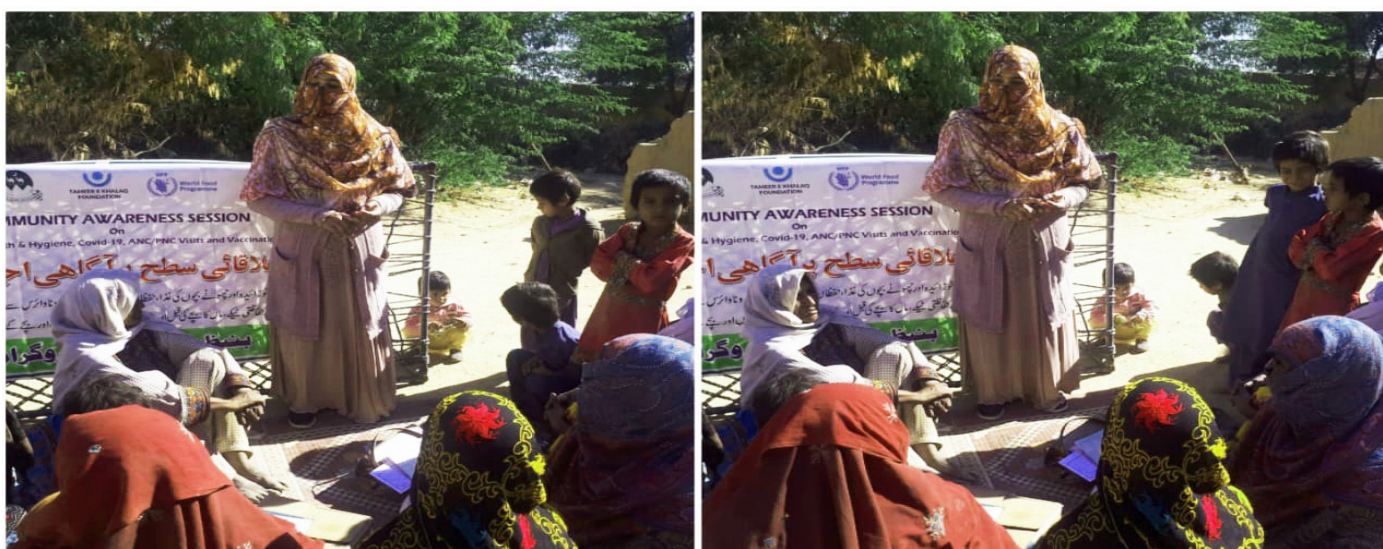
Community Awareness Session on Hygiene, Covid-19, ANC/PNC Visits and Vaccination

Balochistan, nearly 47 percent of children are stunted with heights much less than normal for their age. Most of the stunted children belong to poor and marginalized families of the province. Malnutrition is also rampant among women of reproductive age. Malnutrition is not only confined to children but is also rampant among women of reproductive age suffering from anemia, usually related to iron deficiency as well as