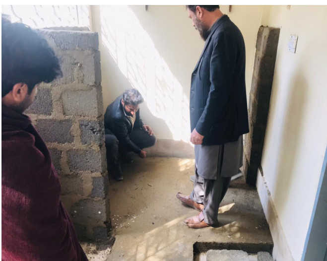
Construction of Wash Stations in Schools at Thatta and Karachi, Sindh