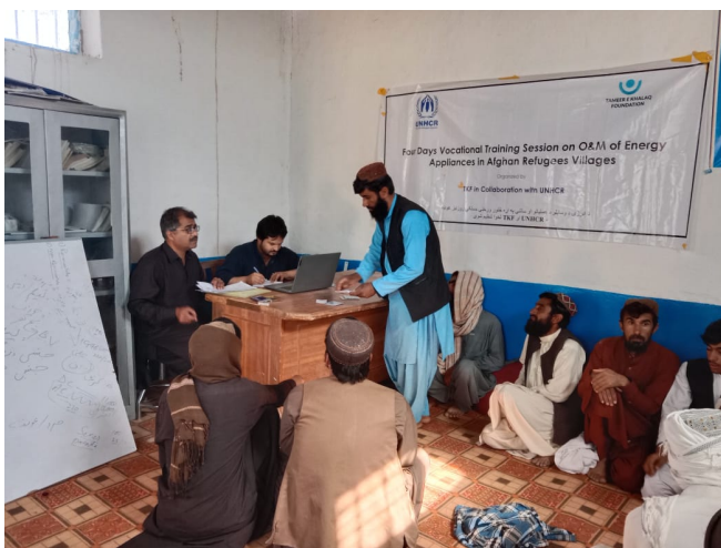
Registration desk for four days vocational training on O&M of Energy appliances in Afghan refugee villages