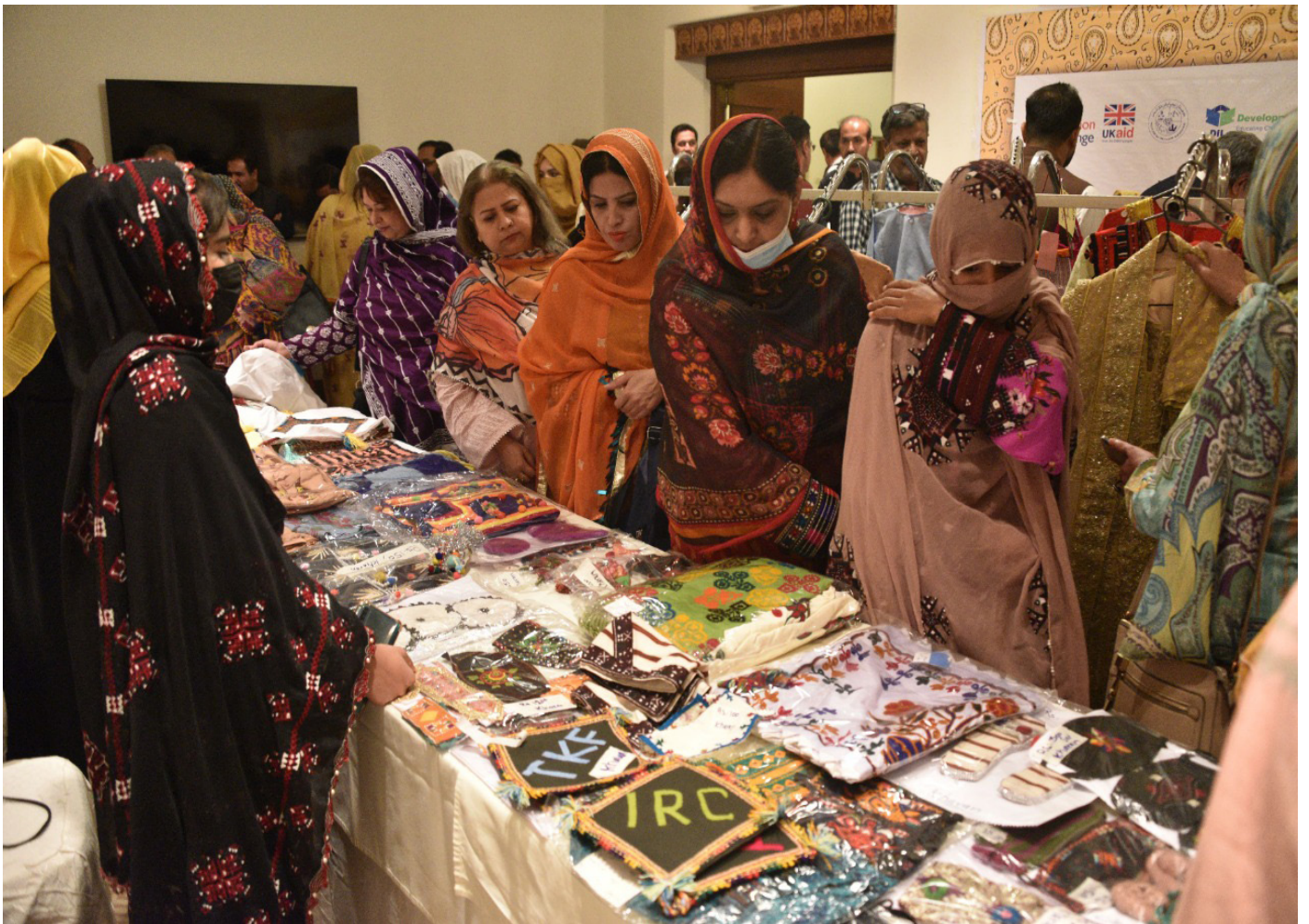
Stalls showcasing work of each district at the extravaganza of skills and crafts under TEACH project