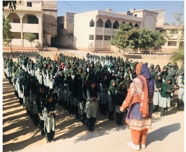
Awareness session in School Assembly on Hygiene and good cleaning practices.

Constructions of Schools 100 schools (Thatta & Karachi ) will be able to ensure basic WASH facilities after construction of Schools and establishment of WASH stations, special targeted girls' Schools more than 60% of Girls schools are targeted to improve basic WASH facilities. 200 Teachers are trained on WASH training which has been held in Karachi and Thatta, they were able to trickle down the school's level WASH Awareness session in their respective Schools, on Personal Hygiene, Waterborne diseases, Vaccine Uptake, TKF has mitigated the mobility barriers in 100 Schools through to identification process and Teachers training Developing strong relationship communication and liaison between TCF and Sindh Education, Social Welfare, RSU Teacher Training - None of the participated teachers in Karachi (100) had ever received WASH training, they pleased to attend that opportunity and actively participated and committing with HBCC-II team they will be contributing and supporting project level activities at their schools and voluntarily support by the formation of Children WASH club, Schools level sessions.