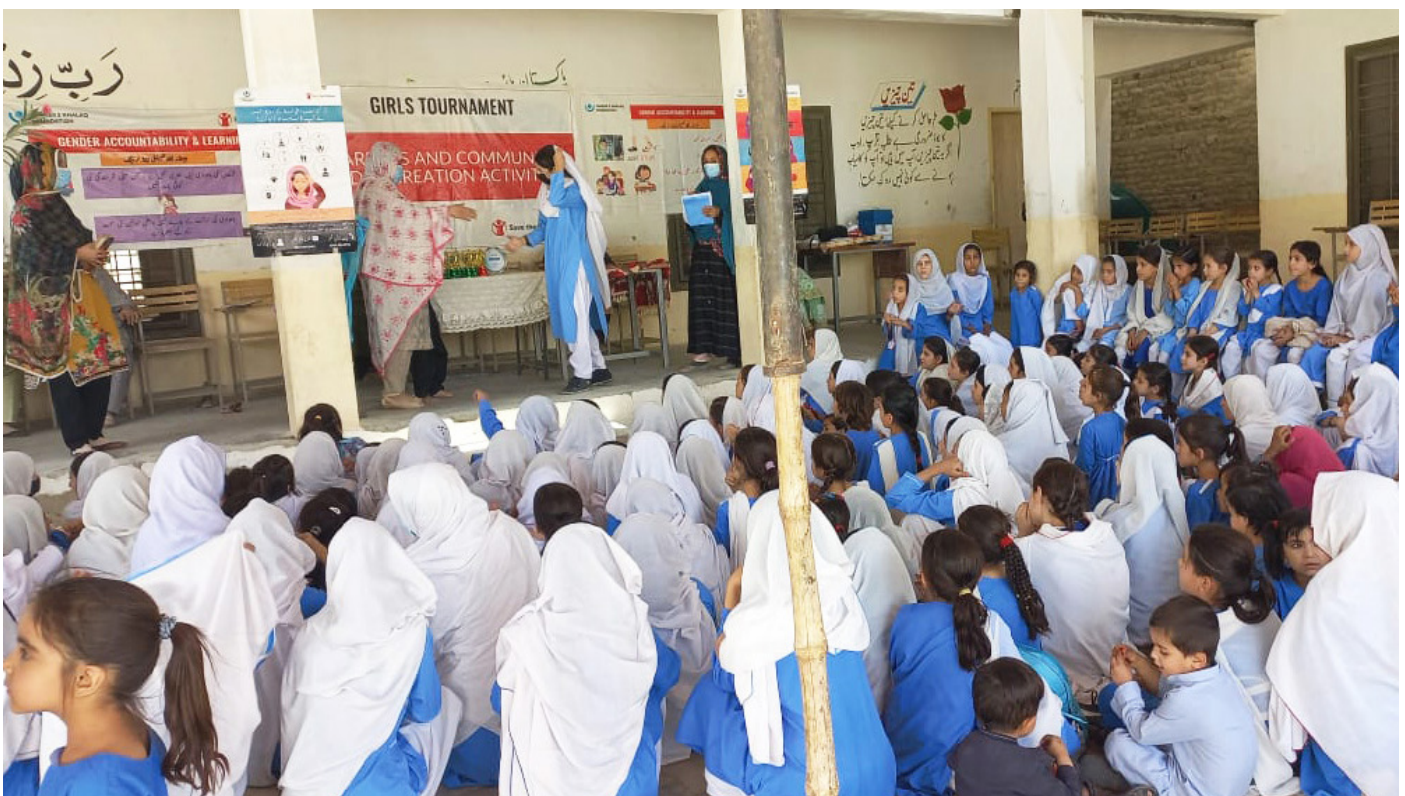
Girls Tournament under Gender Accountability and Learning, Chaman

IEC material displayed with the information of feedback/accountability / reporting numbers Accountability site standard was communicated and displayed for distribution of dignity kits among adolescent girls