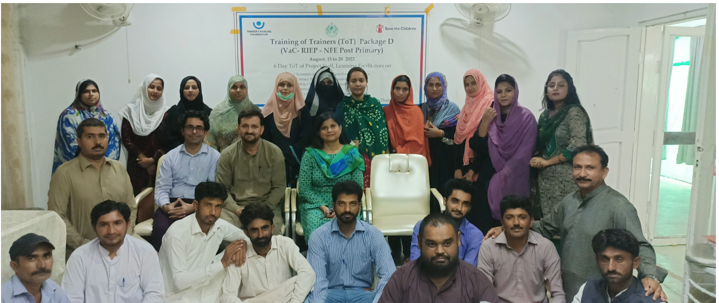
Group Photo after Training of Trainers of Project staff, Learning Facilitators, Thatta