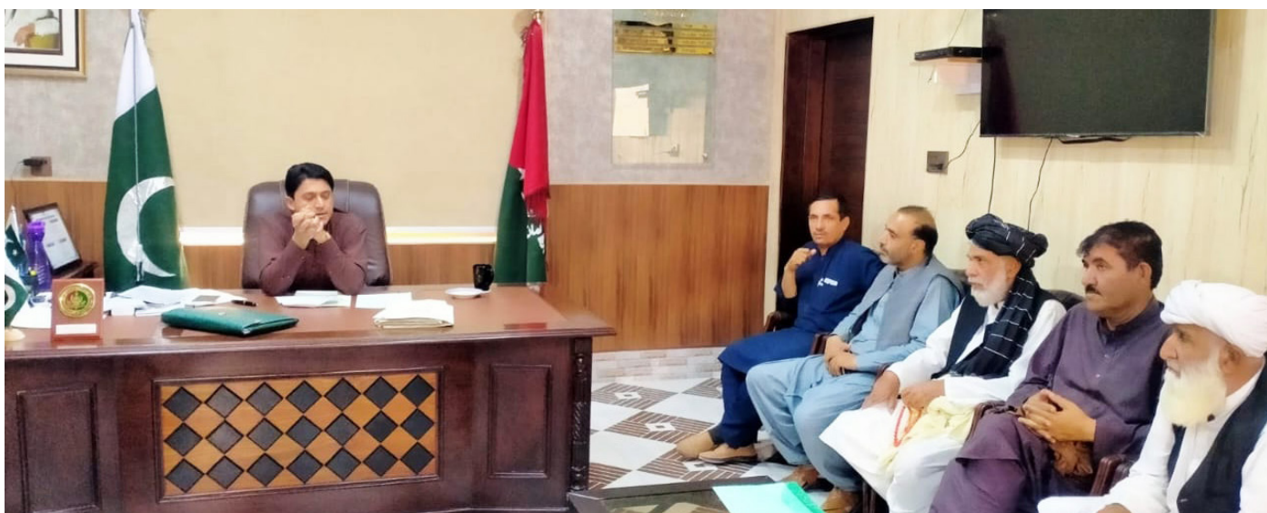
Coordination Meeting with government officials for program implementation