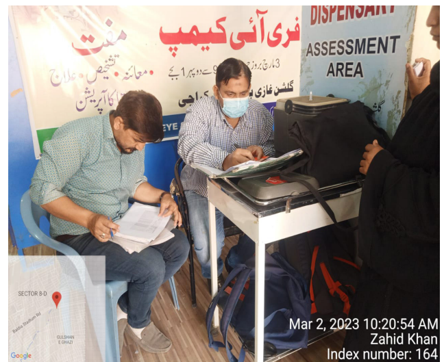
Field Monitors during Monitroig EPI Fix Sites 1

To establish and implement real time monitoring mechanisms by using technology at all levels in HR UCs to strengthen routine immunization service delivery by addressing identified gaps in routine immunization service delivery and logistics through improved coordination, governance, and accountability at all levels in HR UCs. To ensure maximum Zero dose & Defaulter children coverage through effective monitoring in HRUCs