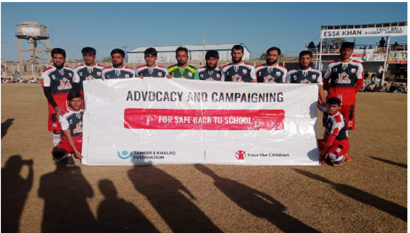
Advocacy and campaigning for safe back to school