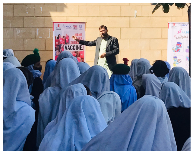
Awareness session on WASH at School, Thatta and Karachi