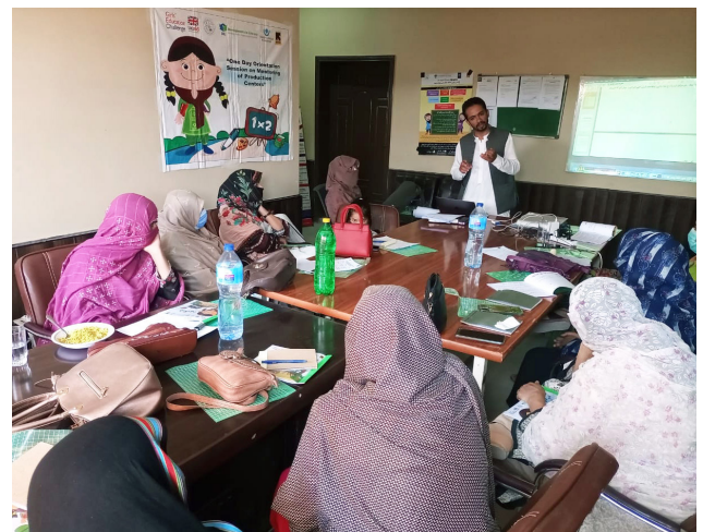
One day orientation session on monitoring of production centers under TEACH project