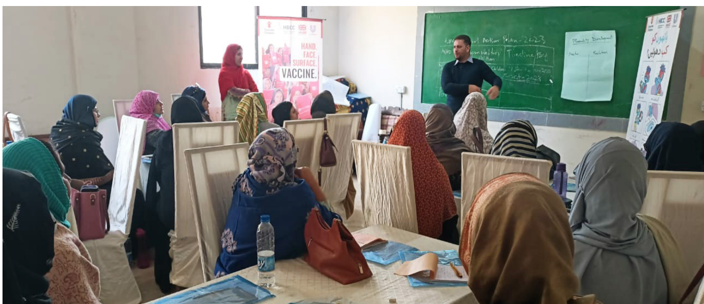
SCI- Analysis -Feedback Collection-From Teacher-TT-HBCC-II