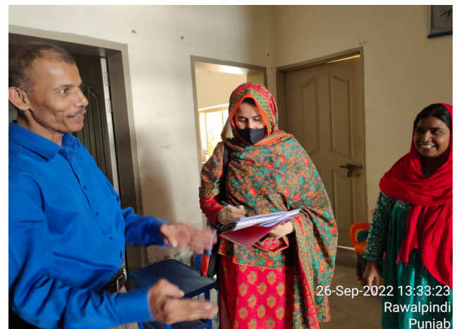
TKF staff conducting key informant interview, Rawalpindi