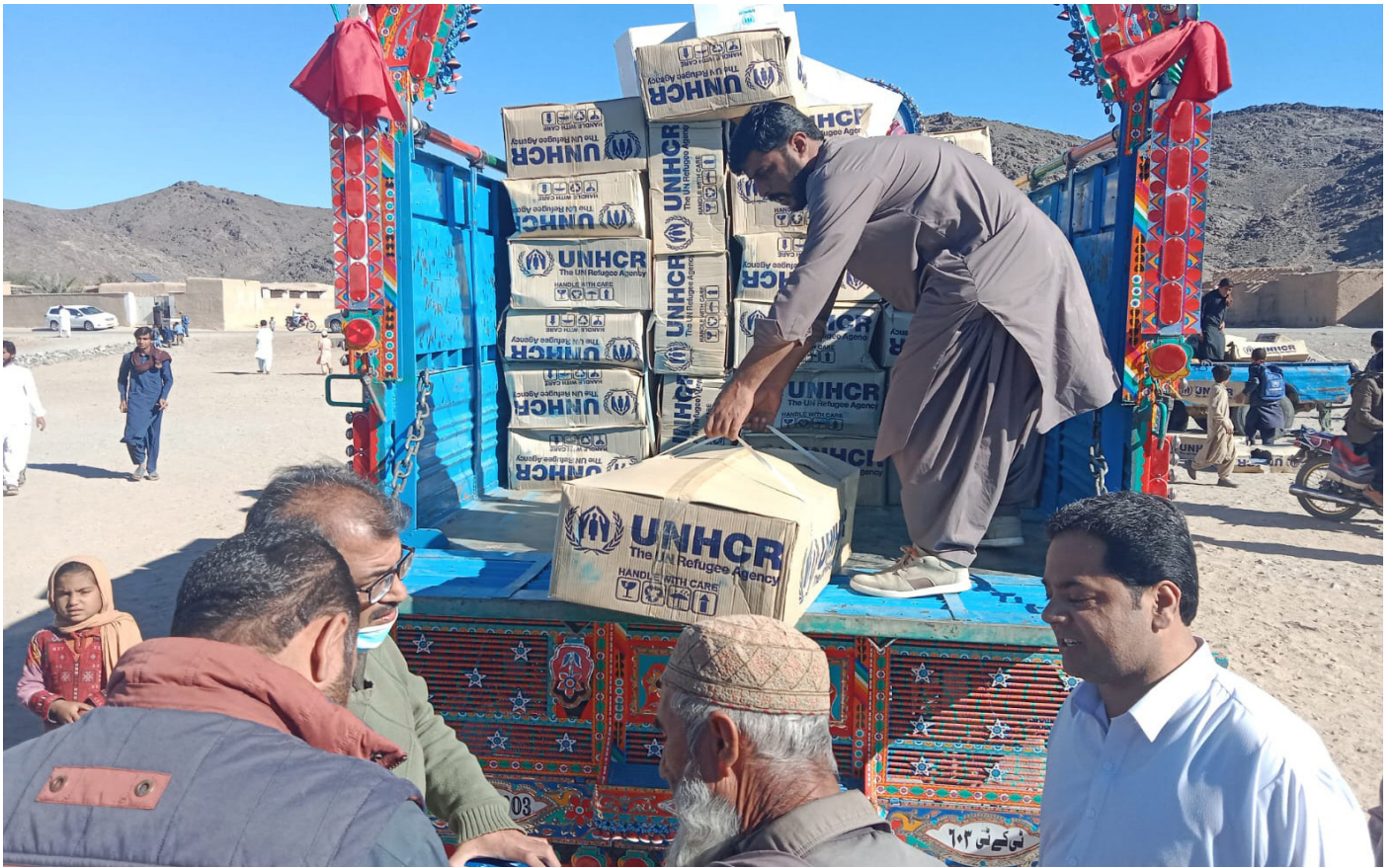
Distribution of Energy appliances, Balochistan