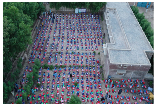
Aerial shot of distribution activities at district Naseerabad and Jafferabad

The project team of the Tameer-e-Khalaq foundation has commenced their intervention after getting NOC from the concerned district administration. In the first phase, a rapid assessment has been carried out by the project team followed by validation by disk review and physical of the flood affectees. The beneficiaries list, plan, and validation have been submitted to the donor for the go-ahead.