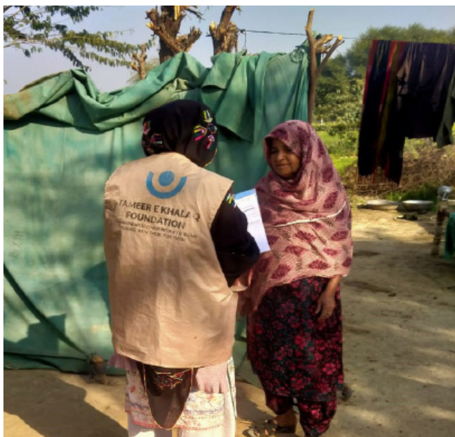
TKF carrying out Flood assessment activities at district Naseerabad and Jafferabad

Based upon the RNA Report of provincial Disaster Management Authority (PDMA) 78% population is of dire need to flood assistance. In this regard OXFAM with implementing partner will be responding to the most immediate needs through integrated flood security, WASH and Protection services alongside cash assistance to flood affected communities of the targeted districts.