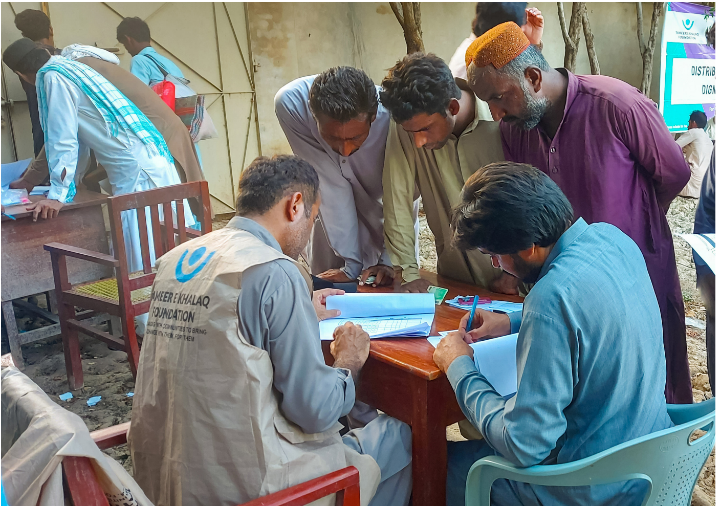
TKF registration desk for WASH kit distribution at district Jafferabad