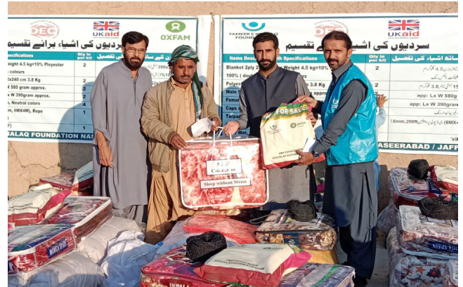
Winterization kit distribution at district Naseerabad

Now, we have planned to go for early recovery as the first phase of the emergency is over now. Therefore, we ought to fund for the next phase and have submitted proposals to different donors.