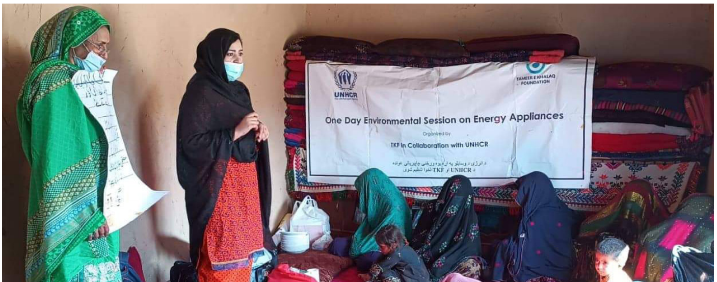
One Day Environmental Session on Energy Appliances, Balochistan

spend up to twelve times more on energy sources, such as firewood, than on health and education. Thus, reliance on inefficient, polluting, unreliable and unsafe energy is not only damaging to the surrounding environment. The exposure to smoke, CO 2 and soot particles while cooking and usage of traditional biomass and firewood results in a significant consumption of harmful gases posing a great risk to the health of respective households. Data management and Situation Analysis: As part of its mandate to protect the world's rapidly increasing refugee population and find sustainable solutions to the refugee crisis, UNHCR and its implementing partners (IPs) are engaged in education, livelihood, and health interventions and initiatives in refugee villages and populations in Balochistan. At present, UNHCR gathers, analyzes, and maintains data from its partners, but has expressed a need for a robust data management solution to understand important on-ground realities. The aim of this assignment is to provide effective data solutions to UNHCR that would foster their decision-making, help them track the progress of their initiatives, and identify any gaps or challenges that can be addressed. An evidence-based analysis is critical to developing, planning and executing a comprehensive effort. In this way, data-gathering and efficient and effective reporting is one of the key mechanisms through which TKF can provide support to UNHCR.