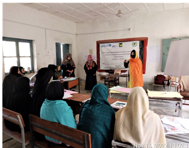
5-Days Training of AEP Facilitators on package A with integration of Homework Assignment and Assessment Techniques at GHS (Orakzai)

the monitoring checklists, reporting formats, meeting minutes, generating & sharing timely reports, and maintaining documented records both in hard and soft for future use etc. TKF maintains a well thought out gender balance policy at all levels of staff recruitment initiatives. At field level the staff composition remains male and female staff in each team with a defined geographic and thematic area for working in consultation with the team supervisor for moving and monitoring the assigned tasks as and when required as per the desired need of program.