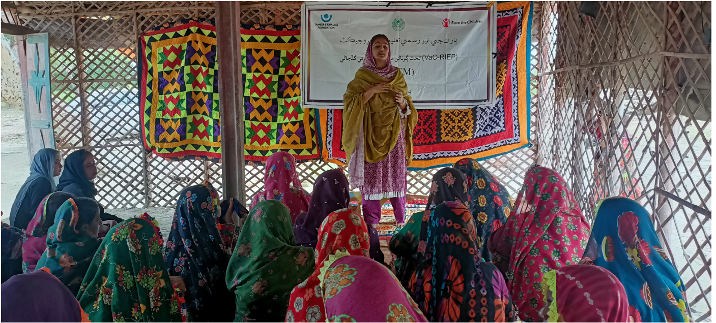
Broad based community meeting with females, Thatta