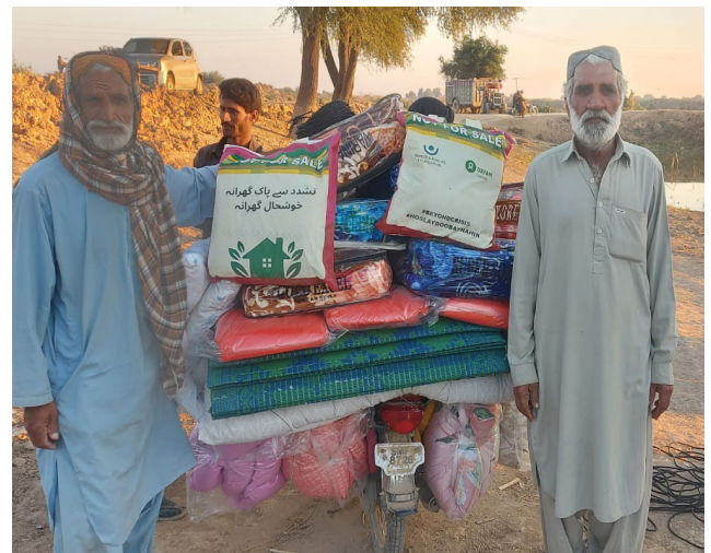
WASH and Winterization kit distribution at district Naseerabad and Jafferabad