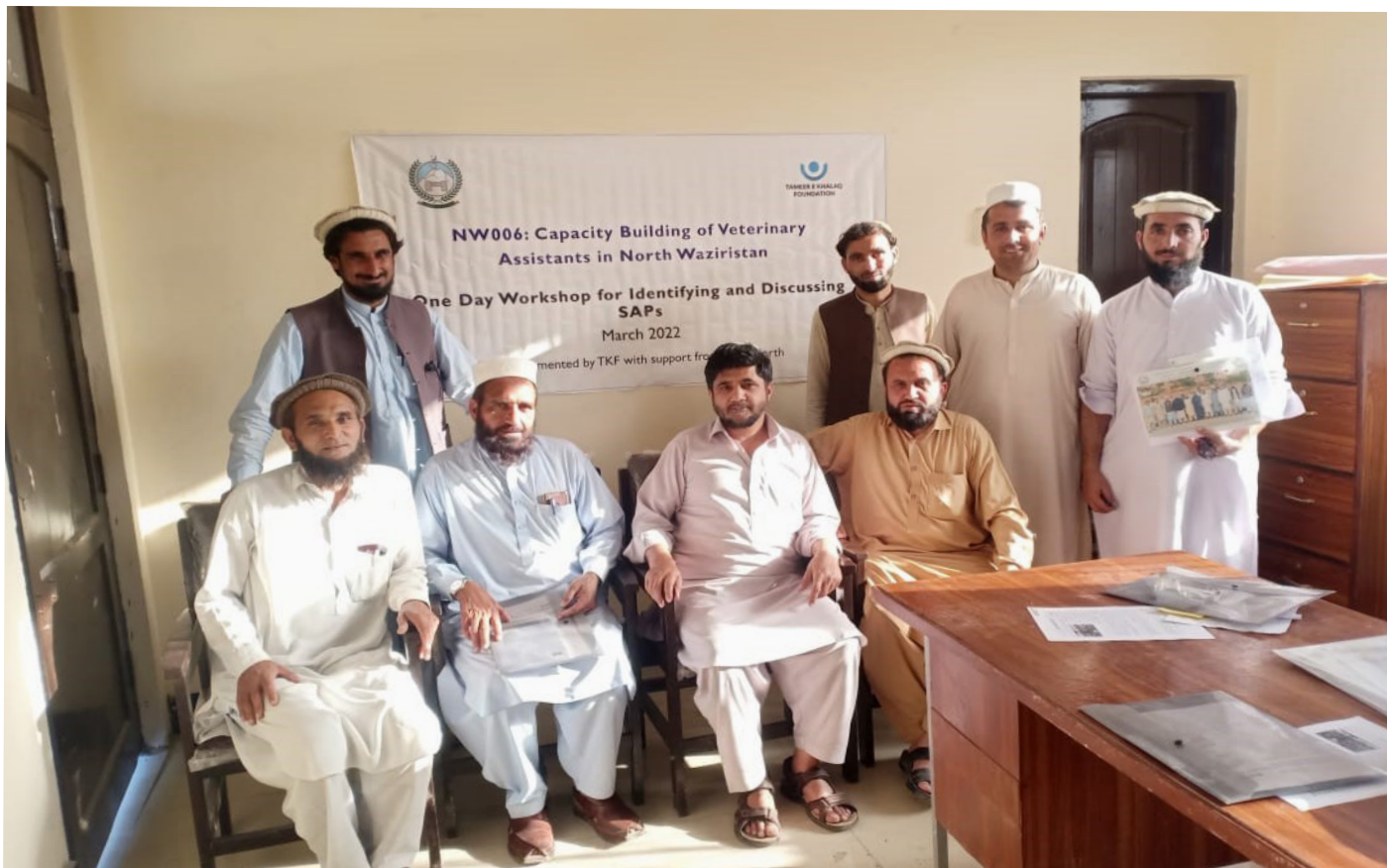
Group Photo at Meeting Hall, AD Livestock Office, North Waziristan