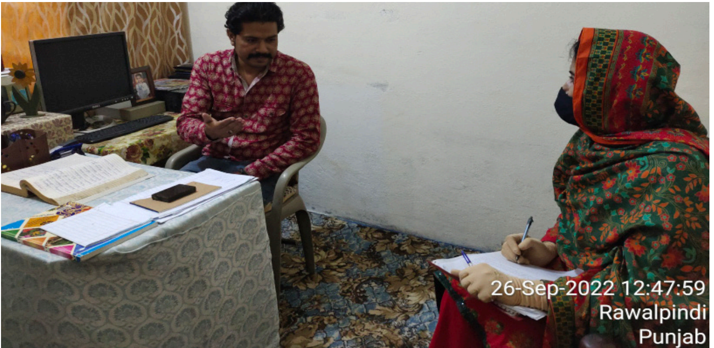
TKF staff conducting key informant interview, Rawalpindi