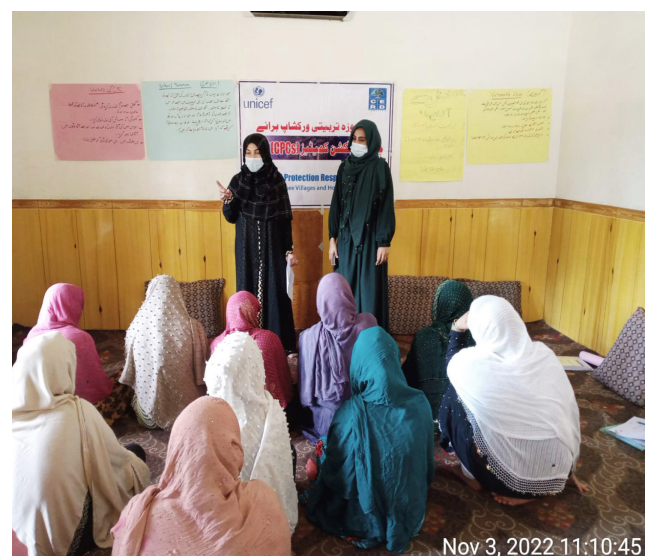
One day Capacity building session on Child protection committee at Ghamgol Refugees camp 3, Kohat