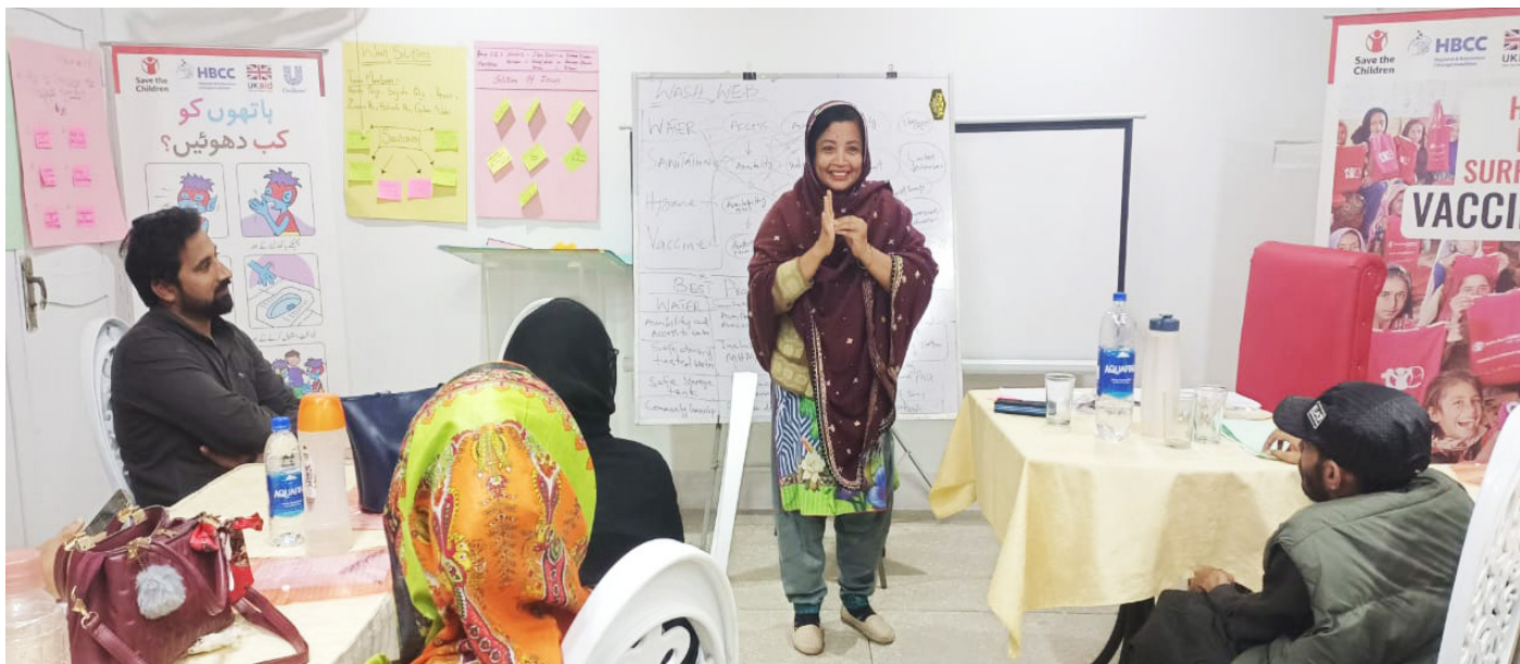
Training of government teachers on Hand Washing Techniques