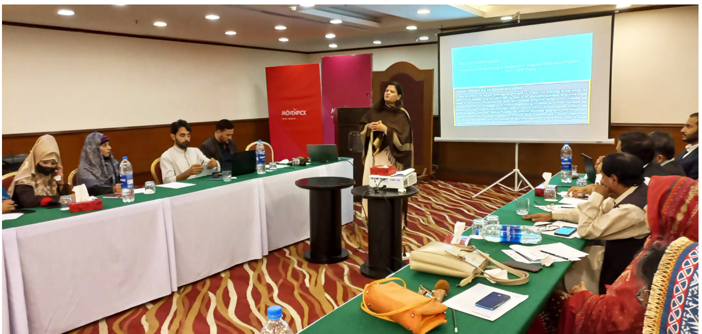
Co-Creation Workshop at PC Thatta