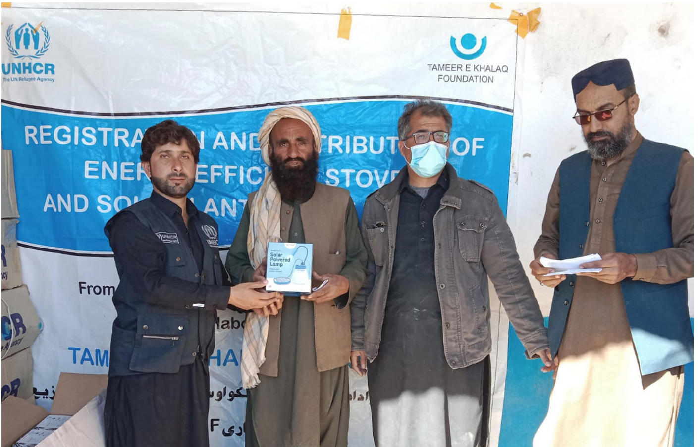
Registration and Distribution of Energy appliances, Balochistan