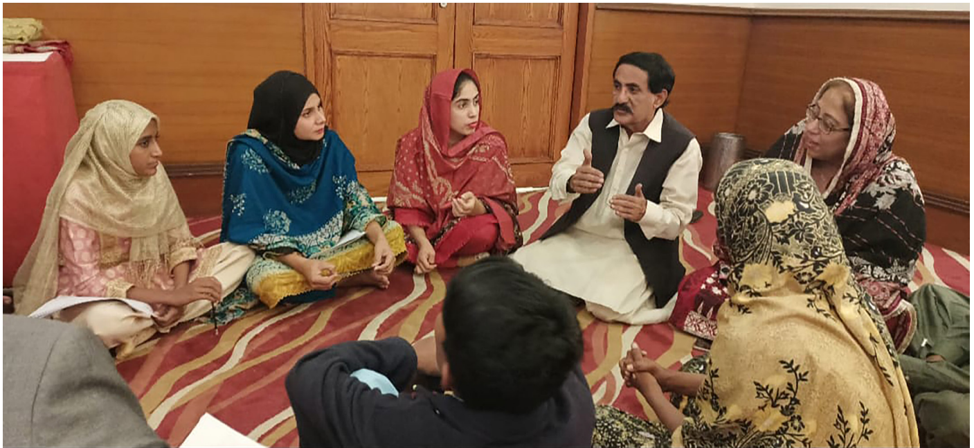
Deputy DEO_SWD Thatta in a discussion at co-creation workshop, Thatta