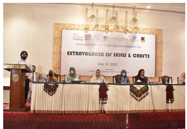
Extravaganza of skills and crafts under TEACH project