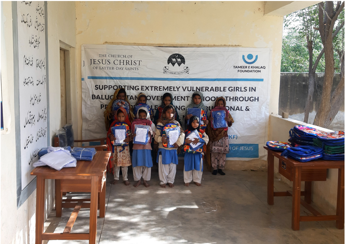
Students receiving stationeries and recreational/support kits