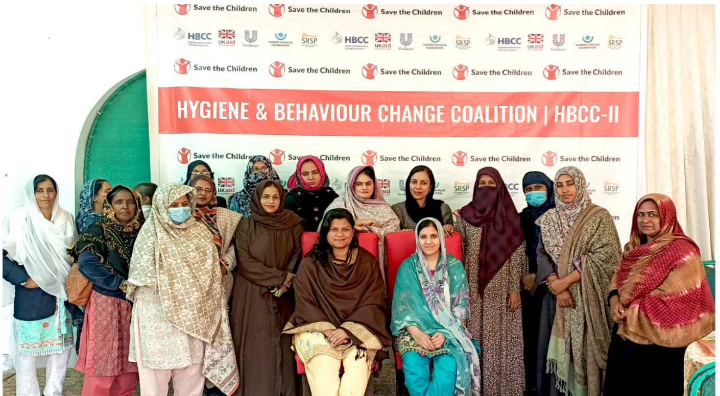
Group photo after Teacher's Training on HBCC-II, Thatta and Karachi