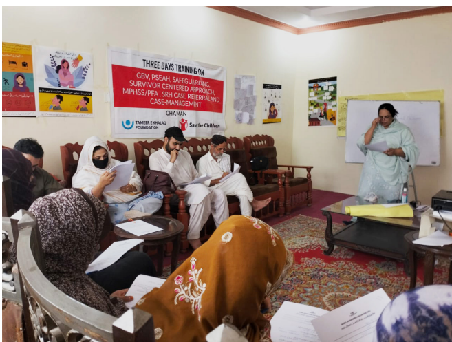
3 Day Training on GBV, PSEAH, Safeguarding survivor centered approach, MPHSS/PFA and Case Management, Chaman

4- Project has impacted positively to develop confidence in adolescent girls' mobility issues free from fear and violence. They could know the issues related to safety and how to address the issues by sharing safety concerns