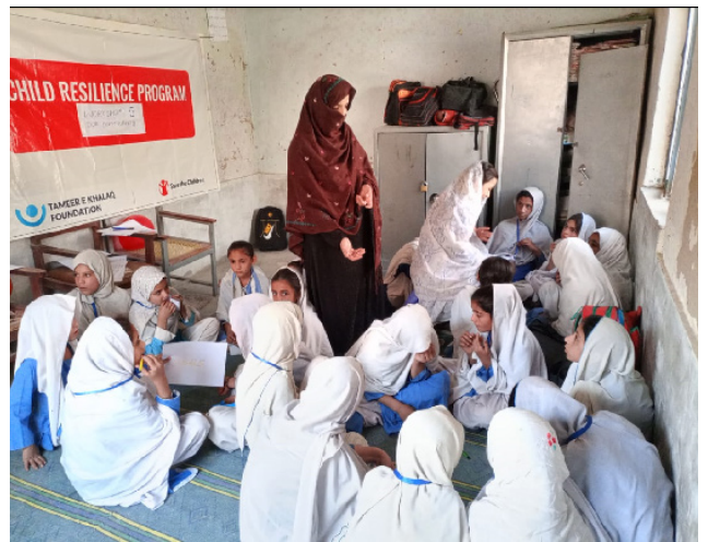
Workshop on child resilience program