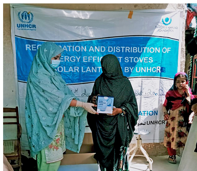
Distribution of Energy Appliances, Balochistan

University level education (disaggregated by gender) Unprecedented rainfall and flooding in late August 2022 resulted in heavy losses to the population of Sindh, KPK and Balochistan. Where host communities were affected similarly it has caused losses to the PoCs as well. Keeping the same in mind have also been affected in some parts of the province. A rapid need assessment will be conducted in the reported areas of District Killa Saifullah, where the PoCs are residing in Malgagai Refugee village and its surrounding areas. In this context the team of data enumerators will carry out a rapid need assessment in the flood affected areas of district Killa Saifullah through an online UNHCR RNA tool. In the aftermath of the devastating floods of 2022 along with the assistance to the PoC on the request of PDMA; UNHCR has provided Core Relief Items to PDMA to be distributed in the flood affected population of district Kachi Bolan, Jafferabad, Naseerabad, Jhal Magsi and Sohbatpur. The CRIs are desired to be distributed through concerned DDMA's of the said districts. TKF through its field observation teams will verify the visibility of these distributed CRIs in for specific period. TKF through its technical team will install the Refugee Housing Units (RHUs) in Quetta, Pishin, Killasaifullah, Killa Abdullah, Jafferabad, Naseerabad and Sohbatpur. In the same continuity TKF will also distribute solar lights to the flood affected population of eastern Balochistan.