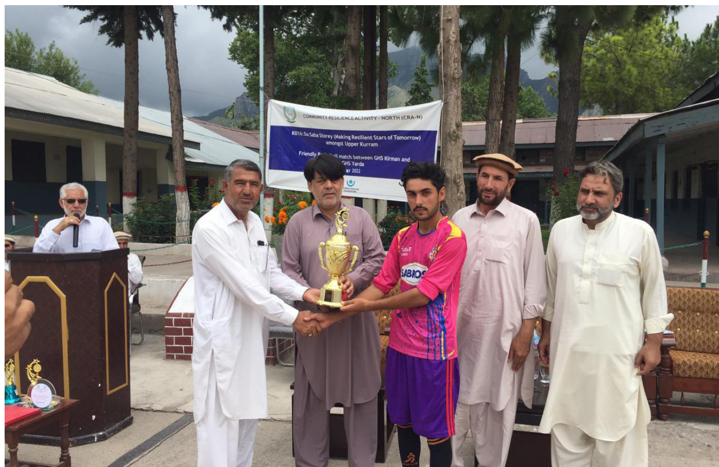
Captain of runner team, GHS Bushera receiving the prize from their respective principals at GHS Kirman _ Community Resilience Activity - CRA-N