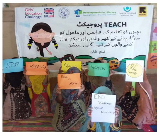
One day orientation session on monitoring of production centers under TEACH project